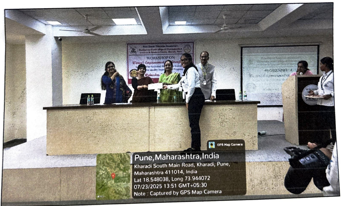
Certificate Distribution to Girl Students during the Valedictory Function