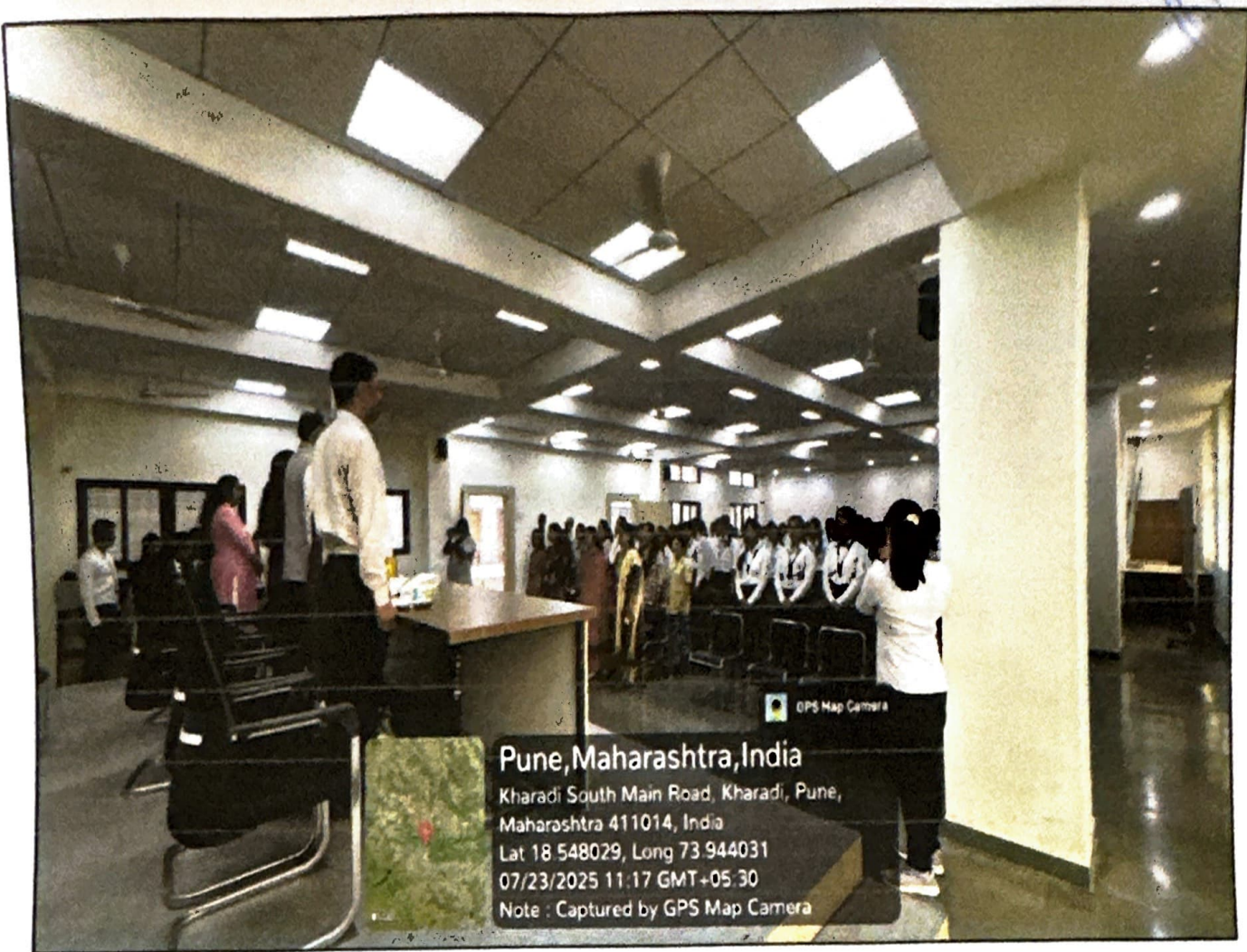
Commencement of the Workshop with Savitribai Phule Pune University Song