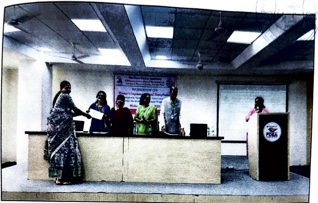
Certificate Distribution to Women Staff during the Valedictory Function