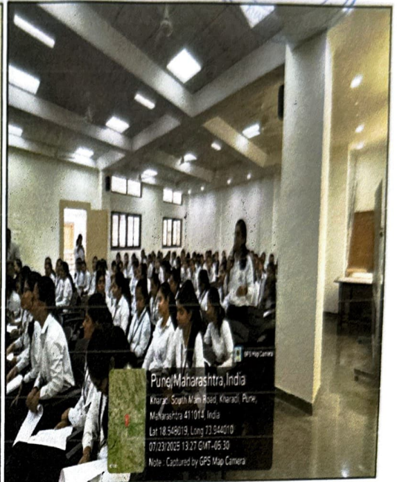
Participants Engaging in Q&A during the Workshop